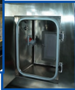
Flush Pocketed Transfer Door