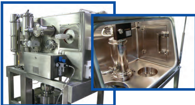
Process Equipment Installation