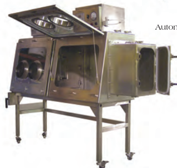
Nitrogen Environment Isolator