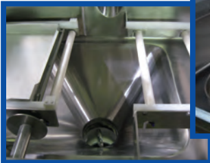
Automated Discharge Funnel