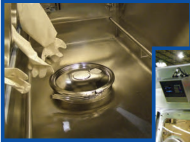
Manway Transfer Ports and Material Trolley Rail