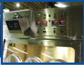
Programmable Logic Controls & Alarm System