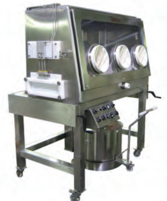
Automated Powder Transfer Isolator