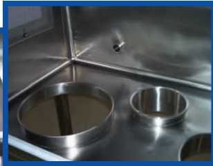
Drum Introduction Ports with Covered Corner Interior