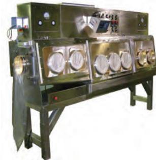
Potent Compound Containment Isolator